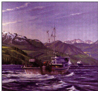
ROYAL CANADIAN in Johnstone Strait: Into the westerly with trawl gear and power skiff. Oil on board, 2004, artist's collection.